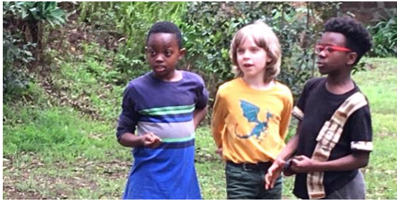
The children have been able to reengage with Kitovu Learning Space, the Kenyan HomeSchool cooperative in which they take part.