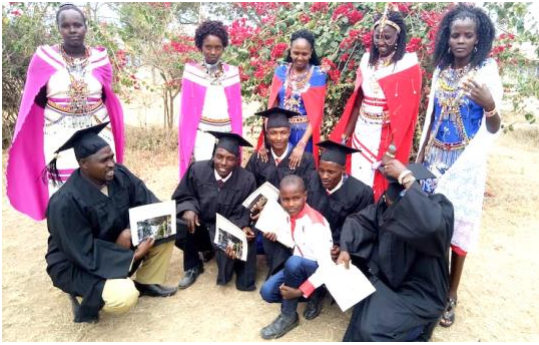
Some of the pastors graduating from CCBTI-Kajiado, with their wives (and one son)