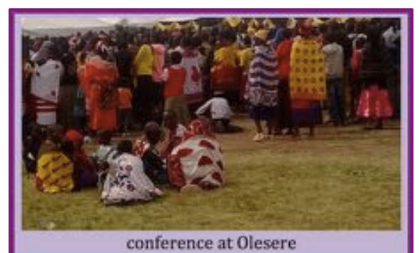
conference at Olesere