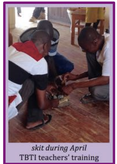
skit during April TBTI teachers' training