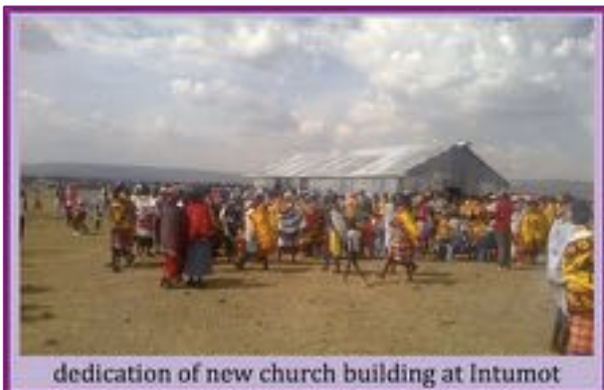
dedication of new church building at Intumot

For perspective, the Mara North area is as large as the cities of Bristol, Mechanicsville, Richmond, Roanoke & Salem in Virginia PLUS Bristol, Elizabethton, Knoxville & Johnson City in Tennessee PLUS Omaha in Nebraska PLUS Council Bluffs in Iowa .